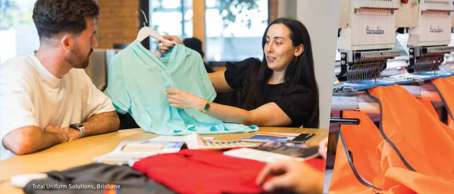
Total Uniform Solutions, Brisbane