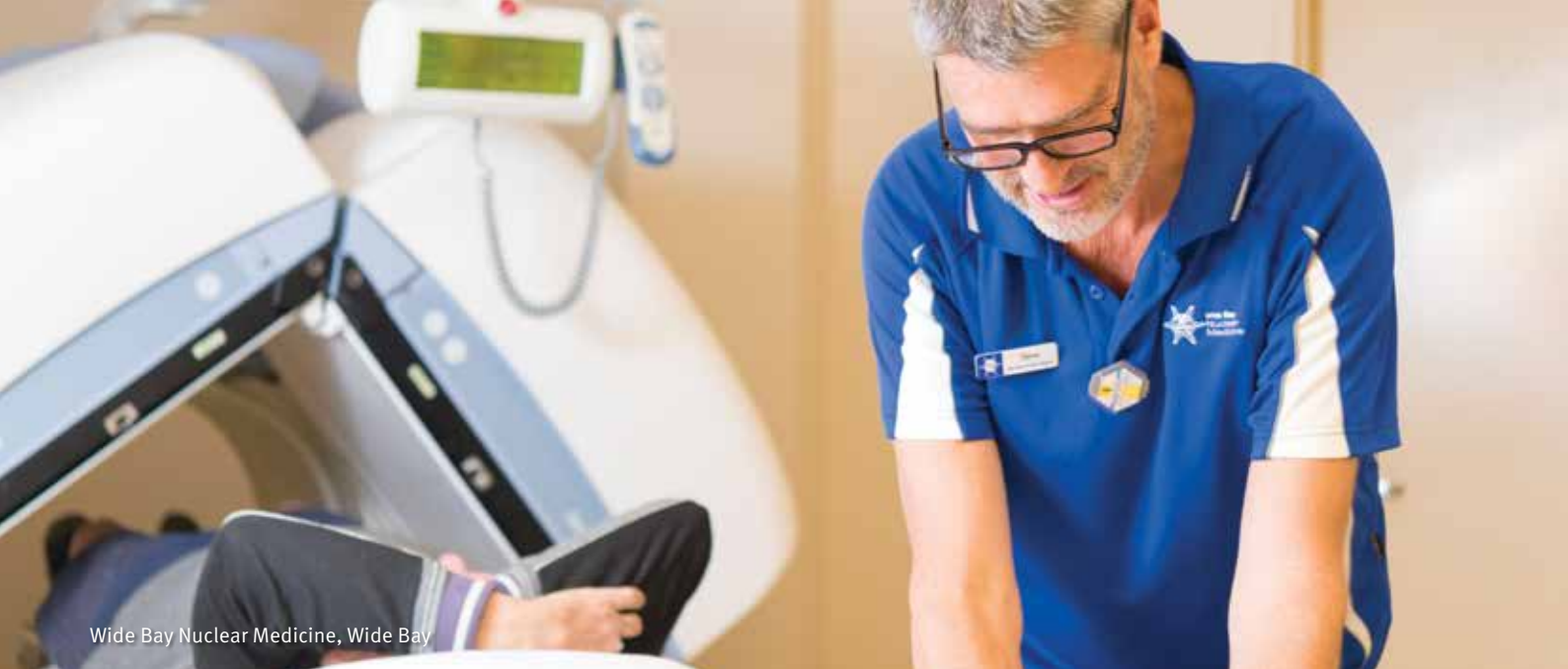
Wide Bay Nuclear Medicine, Wide Bay