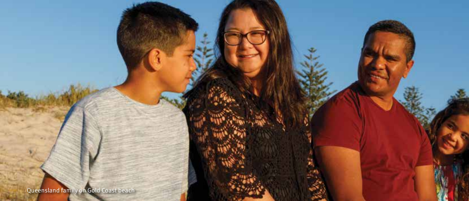
Queensland family on Gold Coast beach