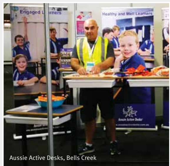
Aussie Active Desks, Bells Creek

Aussie Active Desks received a Highly Commended Award at the 2021 Buy Queensland Supplier Awards in the Putting Queenslanders First category.