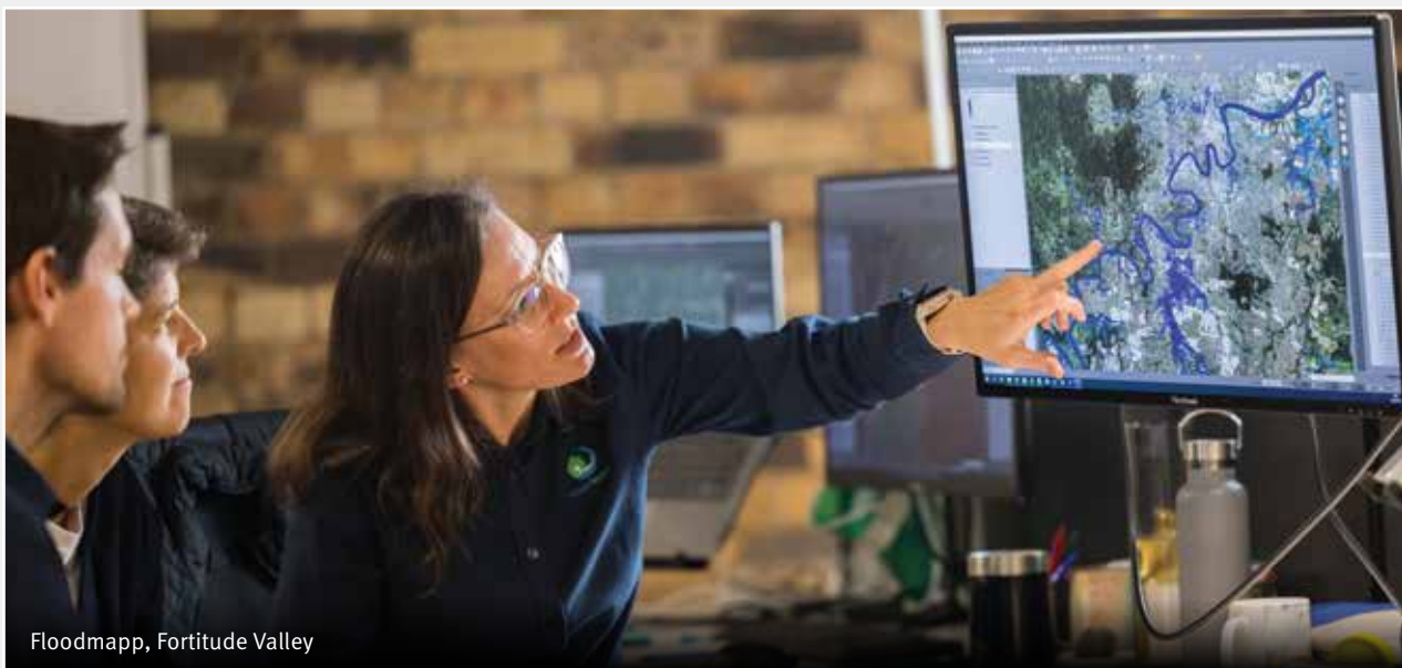
Floodmapp, Fortitude Valley

Supporting local has allowed FloodMapp to 'fuel its growth' to create Queensland jobs and win international contracts, while boosting Queenslanders' resilience.