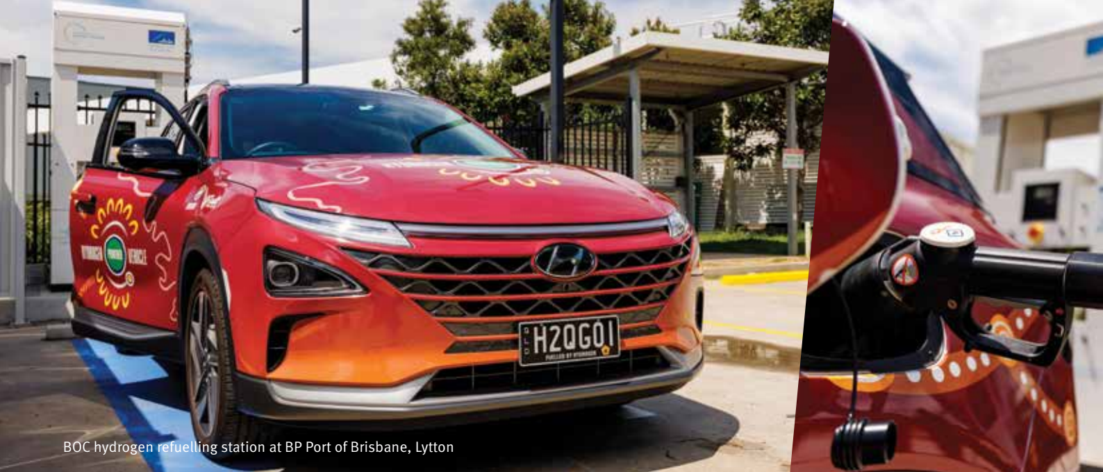
BOC hydrogen refuelling station at BP Port of Brisbane, Lytton