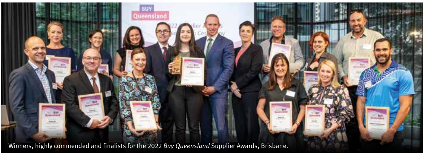
Winners, highly commended and finalists for the 2022 Buy Queensland Supplier Awards, Brisbane.

The QPS applies to budget sector agencies, statutory bodies, government-owned corporations and special purpose vehicles.