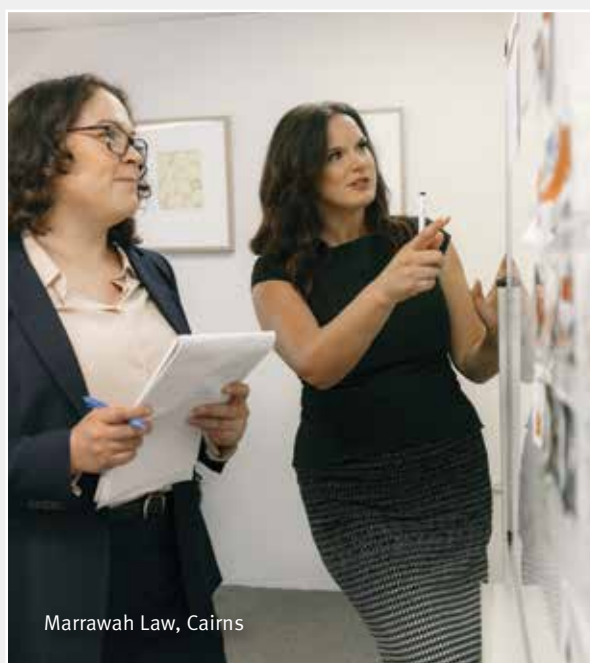
Marrawah Law, Cairns

Supply Nation's research shows for every $1 spent at Marrawah Law, $4.41 of social impact is generated via their pro-bono work, their supply chain, and their more than 80 per cent Indigenous staffing and their clients.