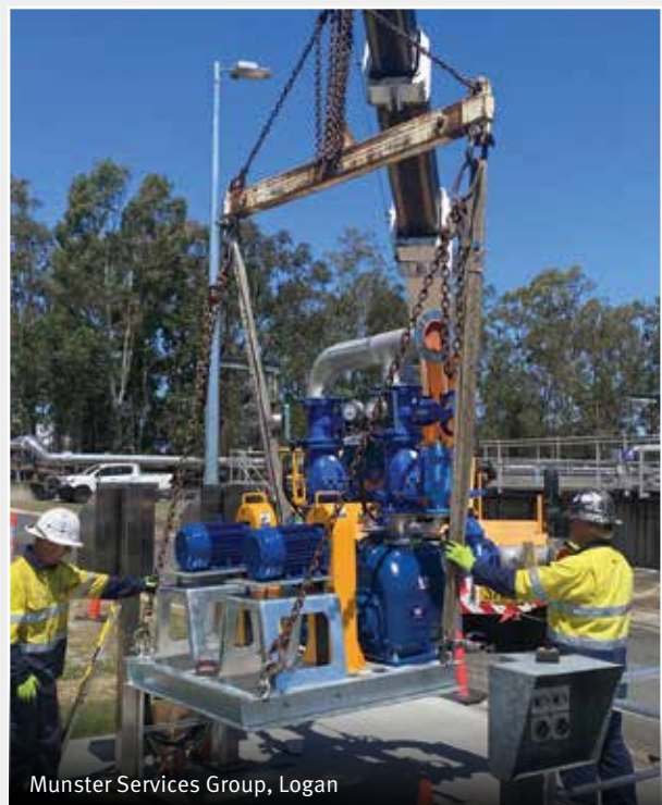
Munster Services Group, Logan

Based in Logan, the company helps maintain Queensland's water and wastewater infrastructure, and services heavy industries. It is Queensland owned and operated, with a workforce of more than 100 full-time permanent employees across all ages, skills, and backgrounds, and is actively supporting women into trades and engineering.