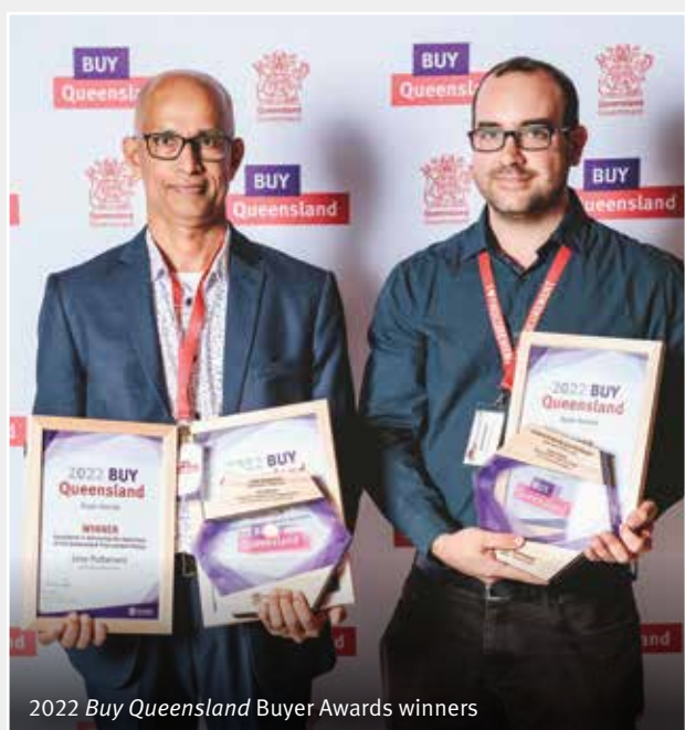
2022 Buy Queensland Buyer Awards winners